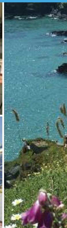
PARTNERS FOR CHANGE: (Clockwise from top left) Project kick-off meeting at the REC; the Cornish coast; agriculture in Le Marche; Bulgarian birdlife; Cornwall's Fal estuary; discussions at the kick-off meeting; Delabole wind turbines; solar panels in Liguria and Cornwall.

"The region of La Rioja is striving to reduce its carbon emissions, and has developed a low carbon and emission mitigation plan and related policies, including a Regional Strategy against Climate Change (2007-2013). The region is eager to work with other regions in Europe to learn how they are working on these issues and to share experiences and ideas, and develop new methods."