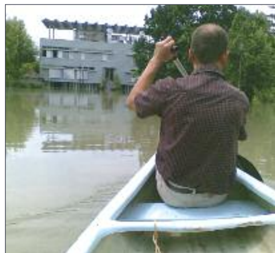
INUNDATED: The REC garden temporarily transformed into a boating lake

Scientists are providing evidence that our climate is changing more rapidly than expected. Recent natural disasters have been linked to climate change: extreme weather events are causing hunger and homelessness, plunging millions of people into humanitarian disasters. But nature is not the primary cause: the blame lies with businesses, governments and individuals, whose unsustainable production and consumption practices result in high levels of greenhouse gas emissions. The problem is exacerbated by a failure to act quickly to bring about significant change.